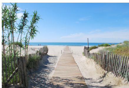
CC0 Domaine public