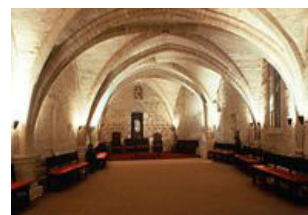
© Edith le Dico & Al LU-SINON

10 minutes walk form the Corum Conference Center.